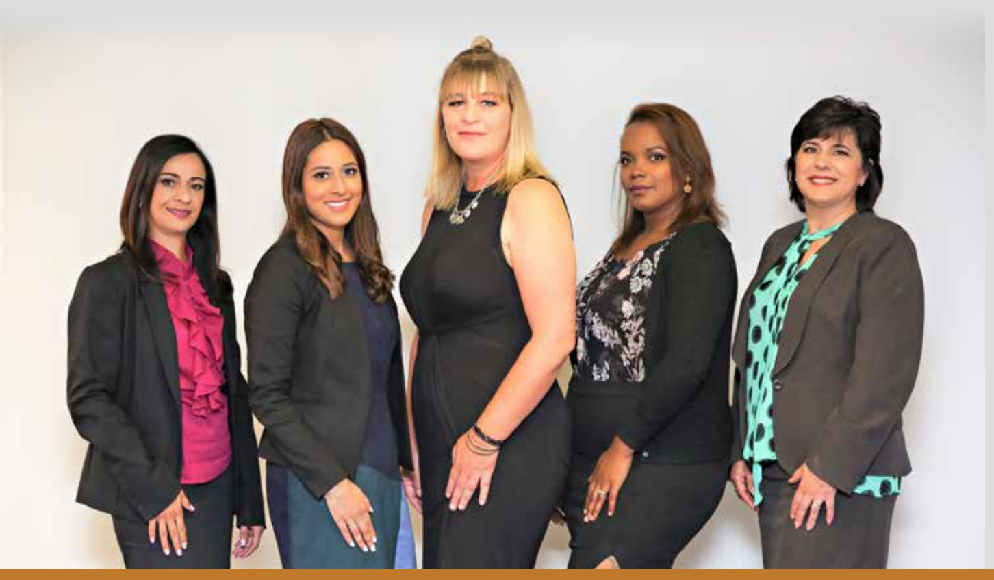
THE CTFA TEAM

Keep safe and take care from The CTFA Team